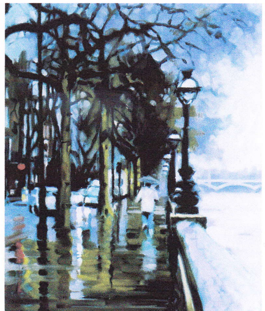
RAIN, CHELSEA EMBANKMENT